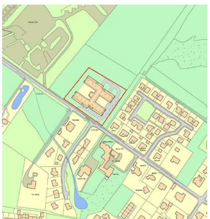
Figure 2: Location Plan (Extract from Drawing No $13_092_$100 - Locality Plan - for information only)

2. The development site is located on the north-east side of Seafield Avenue, on the open grassland/field to the north-west of the existing housing at Seafield Court. The site is approximately 2.33 acres in area. To the south-west of the site on Seafield Avenue is the modern housing development at Rhuarden Court. Seafield Court is also a modern housing development. To the north-west of the site there is a 40 metre wide strip of grassland, with the Caravan site beyond this. To the rear of the site (north-east) is the area of grassland known as The Mossie.