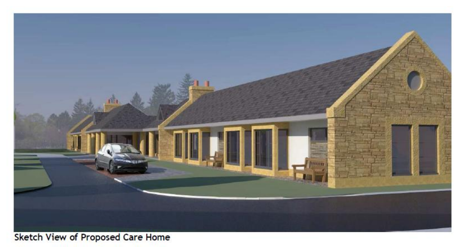
Figure 5: Sketch View of Proposed Care Home (Extract from Design Statement – for information only)

10. Separate vehicle and pedestrian access will be provided to the main entrance from Seafield Avenue. Cycle spaces will be provided for staff and visitors. Twenty-five parking spaces have been shown in total, calculated based on car usage for similar care homes in Muir of Ord and Tain. Disabled parking spaces are provided adjacent to the main entrance.