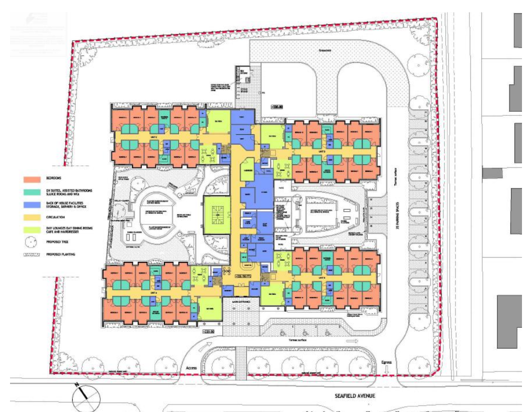
Figure 4: Site Layout (Extract from Drawing No S13_092_320 – Presentation Floor Plan - For information only).